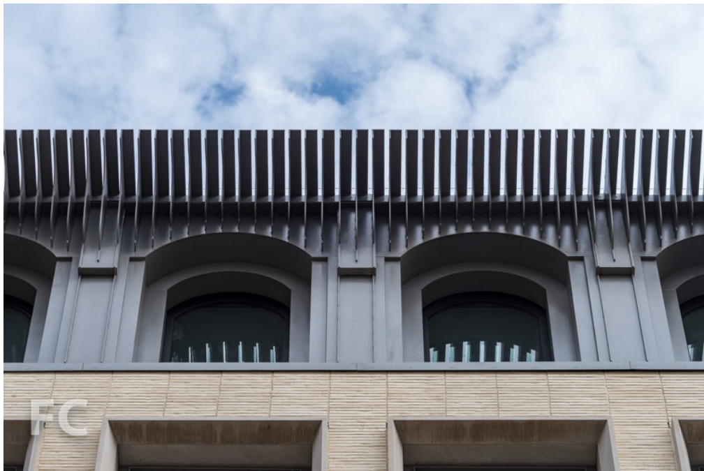
Close-up of the top floor.

Designed in collaboration with HTO Architect, the Wooster Street facade features a pallet of materials inspired by the neighborhood. Indiana limestone framed punch windows are set in a field of handmade Petersen bricks from Denmark. The storefront and residential entry base, as well as the cornice, feature cast iron details.