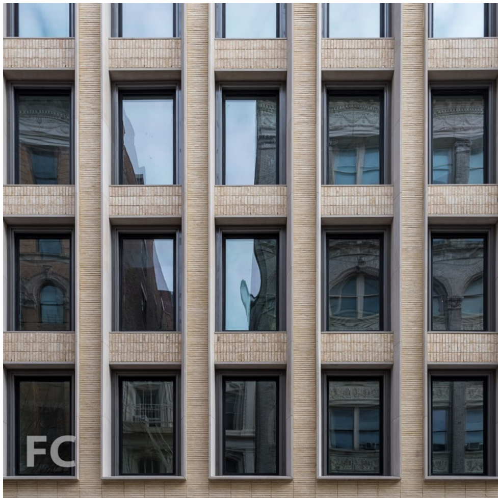
Close-up of the west facade.