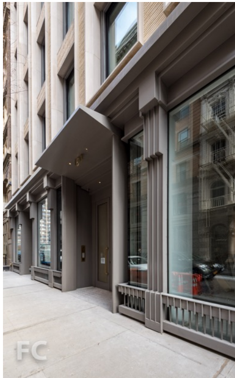
Residential entry and retail at the ground floor.

Architect/Developer: KUB; Landscape Architect: Future Green; Program: Residential, Retail; Location: SoHo, New York, NY; Completion: 2017.