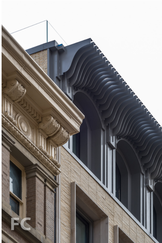
Close-up of the parapet at the northwest corner.

Designed in collaboration with HTO Architect, the Wooster Street facade features a pallet of materials inspired by the neighborhood. Indiana limestone framed punch windows are set in a field of handmade Petersen bricks from Denmark. The storefront and residential entry base, as well as the cornice, feature cast iron details.