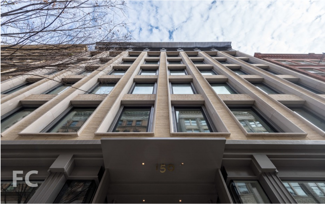
Looking up at the west facade.