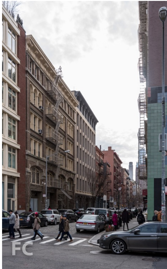
Looking south from Houston Street.

Construction has wrapped up at KUB Capital's 150 Wooster, an 8-story residential building in SoHo. The building replaces a 1-story retail structure and parking lot and required approval from the Landmarks Preservation Commission due to its location in the historic SoHo neighborhood.