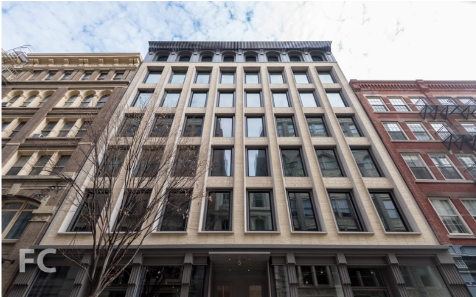
Looking up at the west facade.

The building offers five full floor residences and a duplex penthouse at the top two floors. Two retail spaces at 5,000 square feet each are located at the ground floor.