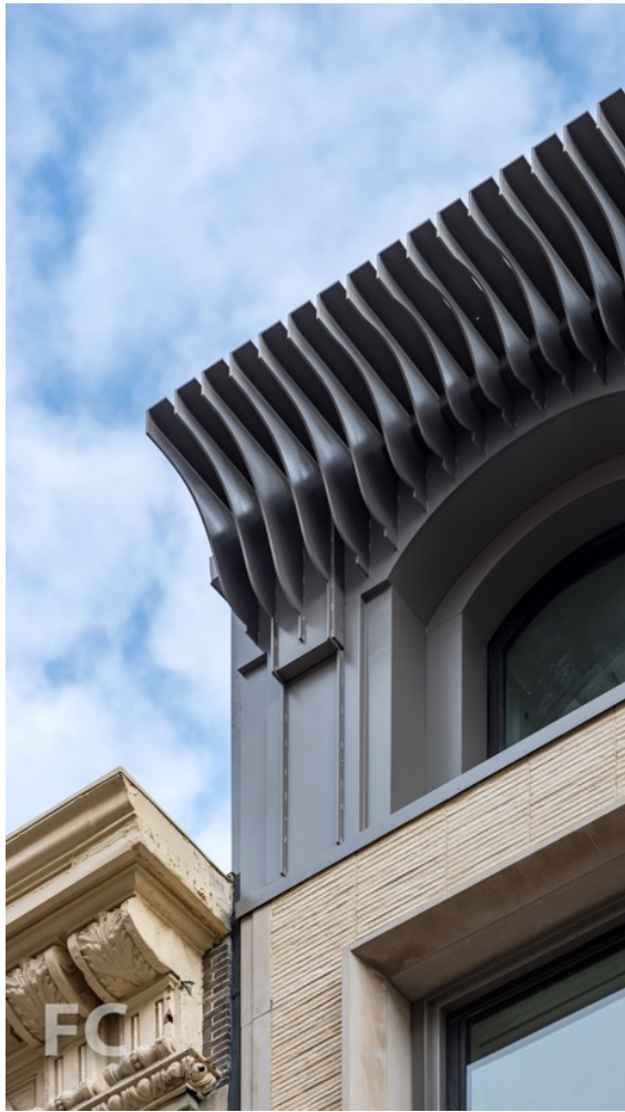
Close-up of the parapet at the northwest corner.