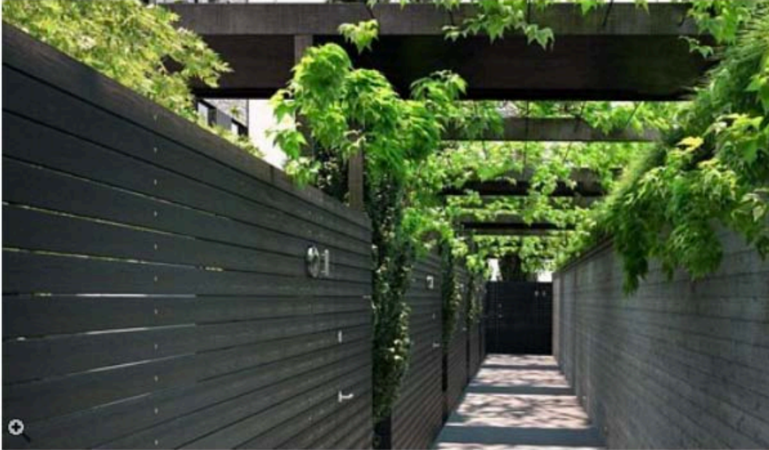
[The private Wythe Lane walkway]