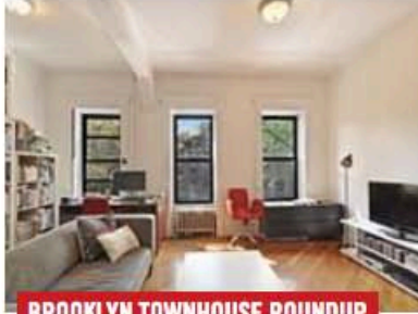
BROOKLYN TOWNHOUSE ROUNDUP

Write A Poem to Win VIP Access to Open House New York