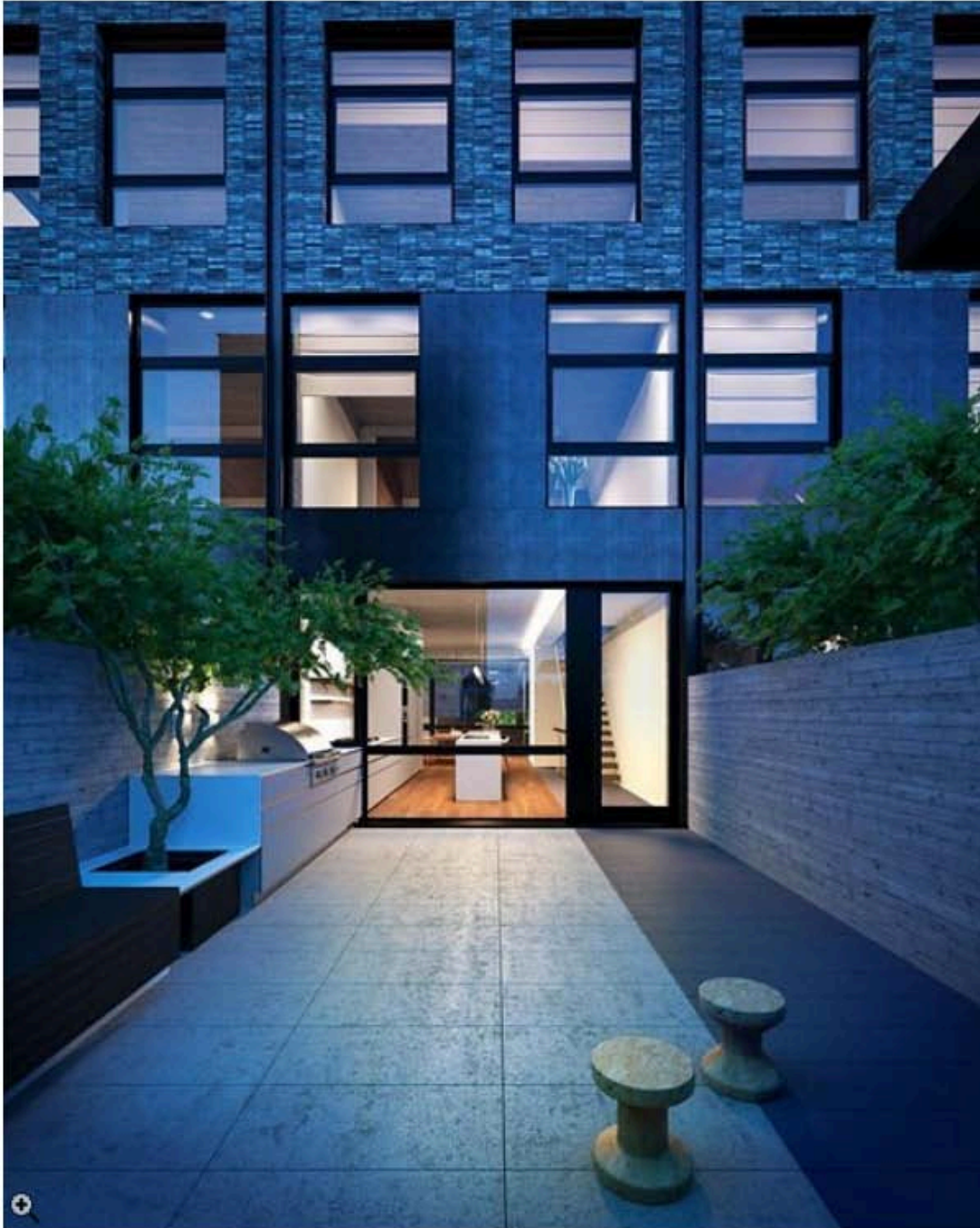
[A backyard of a Wythe Lane house]