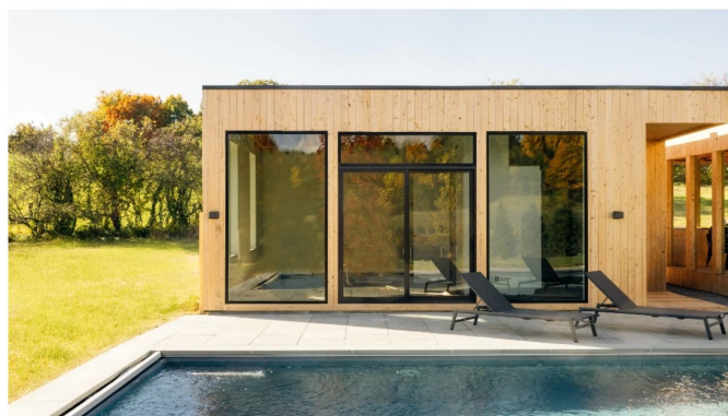
The Rift house's Scandinavian architecture.