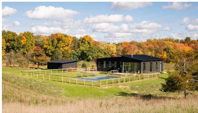
The homes are set on parcels ranging from five to 15 acres.