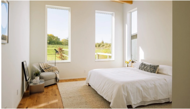
A bedroom in the Loft house. Arcus Development

Fox Hollow is a true private neighborhood, void of any communal amenity spaces like tennis courts, to make each home feel secluded and exclusive. The idyllic neighborhood is also close to several restaurants, markets, vineyards, breweries, art galleries and cultural hubs that make it the perfect under-the-radar spot. It's even a low-key destination for celebs looking to escape the spotlight. It's also a great year-round destination.