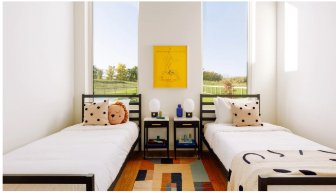
Floor plans include three or four bedrooms. Arcus Development