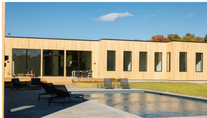
The Rift house design. Arcus Development

“Everything is very much inspired by Scandinavian or mid-century modern architecture,” he says. “I don’t like truly new, contemporary architecture as I find it to be a bit cold, but I do love Scandinavian architecture. The Loft design incorporates aspects of loft-style living in New York. We have exposed duct and some exposed conduit, by design. In the main living space, all the ceilings have exposed wood and exposed joists that are part of the structure. With Rift , it’s very minimal, Scandinavian and serene in the sense that everything on the inside is a matching white oak, from the floors to the ceilings to the windows and doors.”