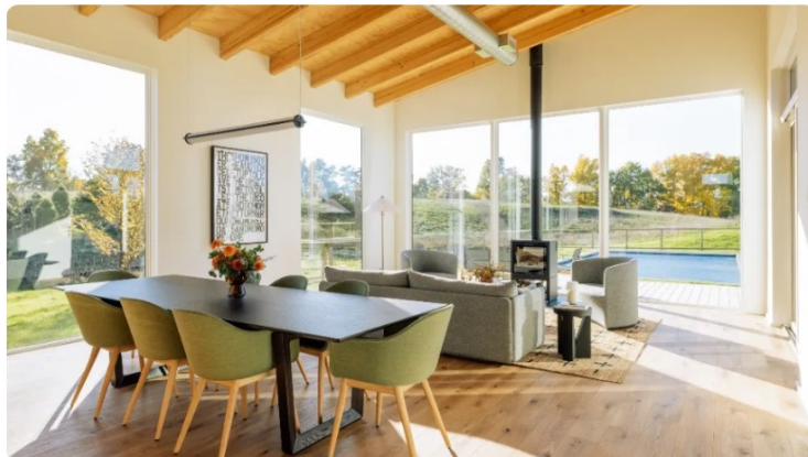
The open floor plan for the Loft house.

There will be 12 homes on parcels ranging from five to 15 acres. The 93-acre property is virtually untouched and features natural streams, hills, wooded expanses and Catskill mountain views with touches by landscape designer Wagner Hodgson. There are two styles of houses (six of each): Loft , which has a modern industrial feel, and Rift , a Scandinavian-inspired design. While the homes are pre-built, buyers have the choice to incorporate add-ons like a heated saltwater gunite pool, bluestone pool patio, 605-square-foot pool house, a 450-square-foot three-season screened pavilion, outdoor kitchen or other features. The pool house can also be customized to include a bath, kitchenette and sauna. If they choose, buyers can customize certain details like the color of siding on their homes.