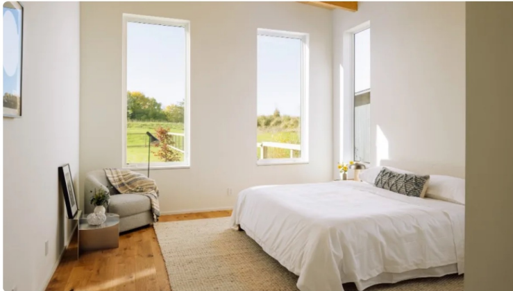
A bedroom in the Loft house.

The larger Rift houses span 2,675 square feet and have four bedrooms and four bathrooms, plus a den and unfinished basement. The Loft houses measure roughly 2,150 square feet and will have three bedrooms, three bathrooms and a den. Each also comes with a standalone carport and optional electric car charger. Both options come with ultra-high, 16-foot ceilings, oversized windows and open floor plans.