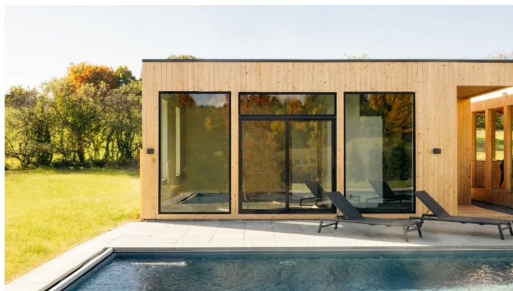
The Rift house's Scandinavian architecture.