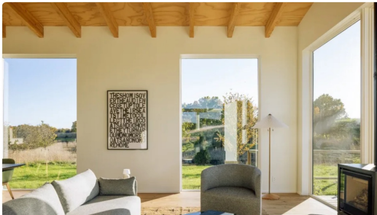
A living area.

Check out more photos of the property below: