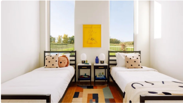
Floor plans include three or four bedrooms.