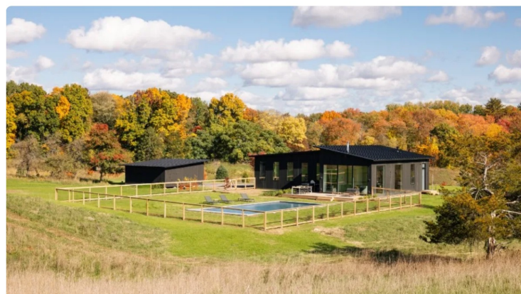
The homes are set on parcels ranging from five to 15 acres.